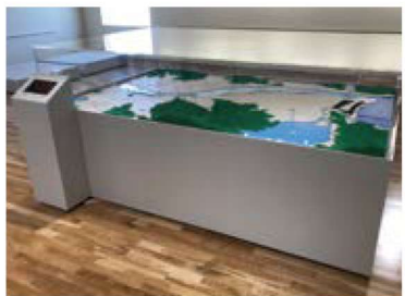
Exhibition room (diorama)

Consisting mainly of an exhibition area covering the events on that day from the earthquake to the onset of the tsunami, the damage to the area, and also the subsequent court case brought by the bereaved families, this facility also boasts a multi-purpose area that can be used for speeches, meetings etc